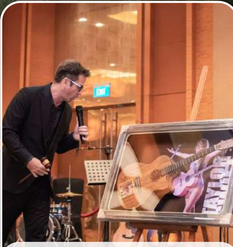
Taylor Swift's guitar as an auction piece.