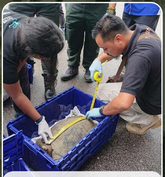
A Malaysian giant turtle was repatriated to Malaysia in 2017.