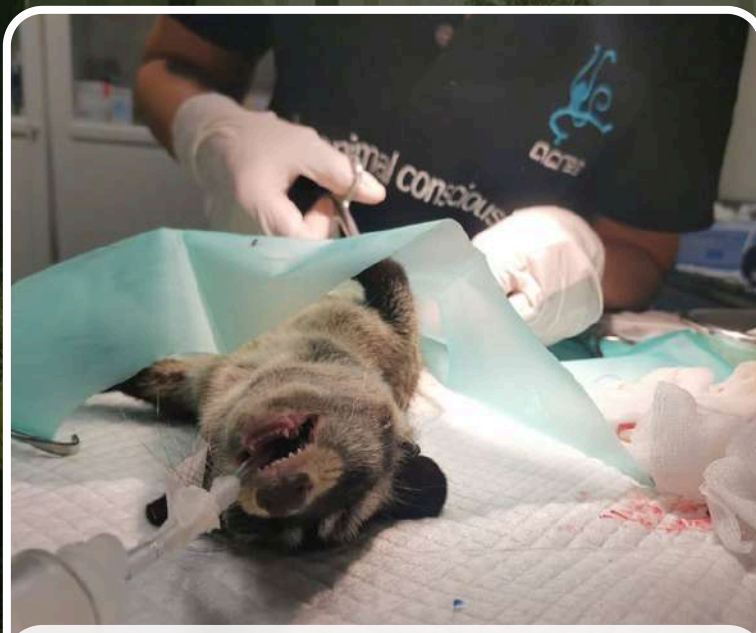
The veterinary team administering treatment to a common palm civet.