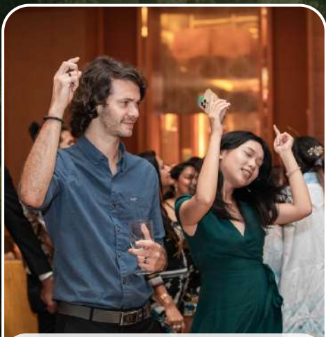
Dance party began!