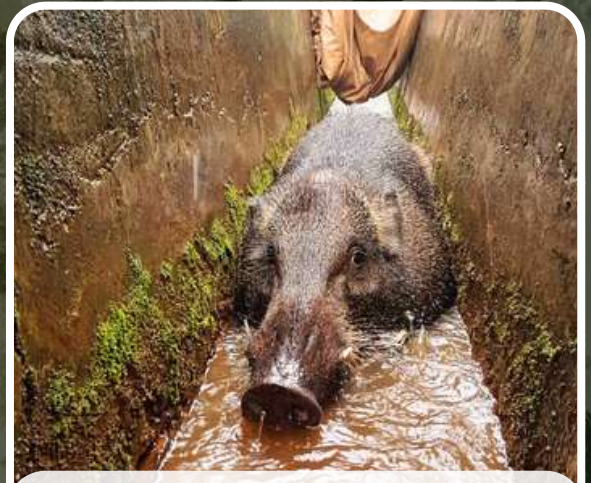
A wild boar waits for rescue after becoming trapped in a flooded storm drain.