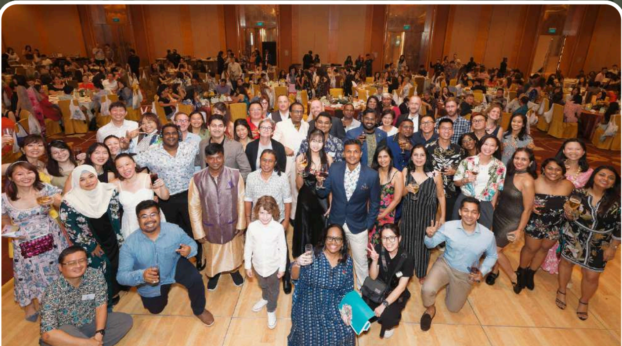
ACRES's 23rd Annual Gala Fundraiser Dinner held in 2024.

Please let me know if you have any questions. We would be more than happy to schedule a chat or meeting with you, to explore this further, if you are interested in exploring this in-kind sponsorship collaboration with us.