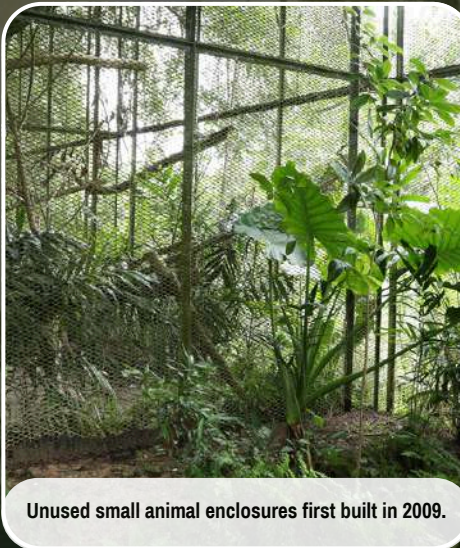
Unused small animal enclosures first built in 2009.