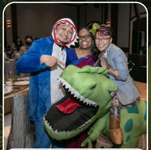
Competing for Best Dressed Table!