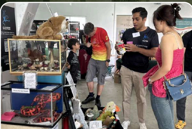
The outreach team raising awareness on wildlife crime.