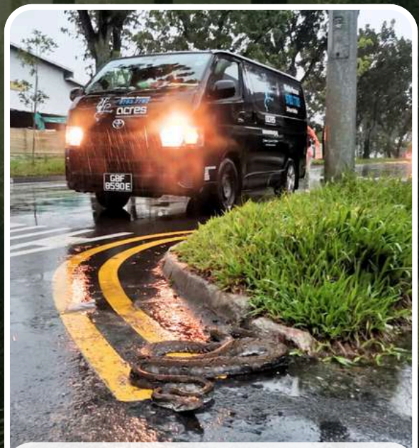
The ACRES Wildlife Rescue Van on-site at a hit-and-run case involving a reticulated python.