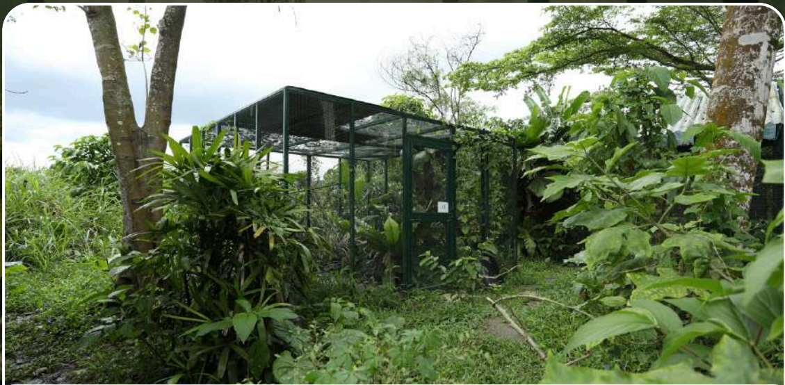
Unused land and infrastructures to be developed for Wildlife Sanctuary.

Every moment of the night will be dedicated to supporting the mission of protecting and advocating for wildlife.