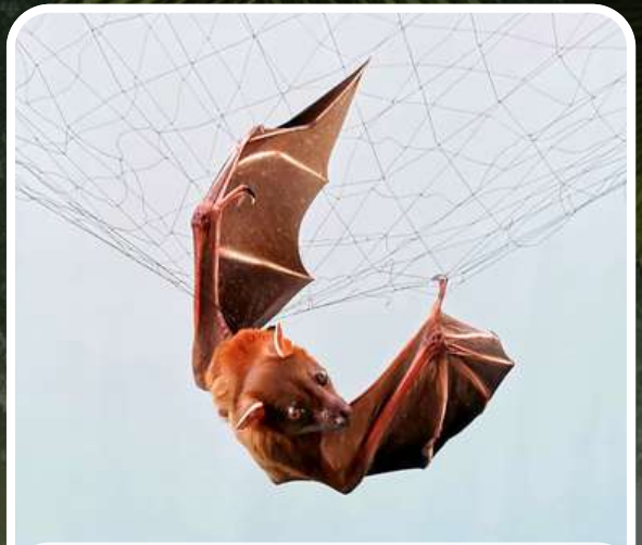
A fruit bat, entangled in a mist net, received medical treatment and a safe release back into the wild.

Your support at our annual gala dinner will directly contribute to giving rescued wild animals a second chance at life. Your generosity means the world to us and the animals we protect.