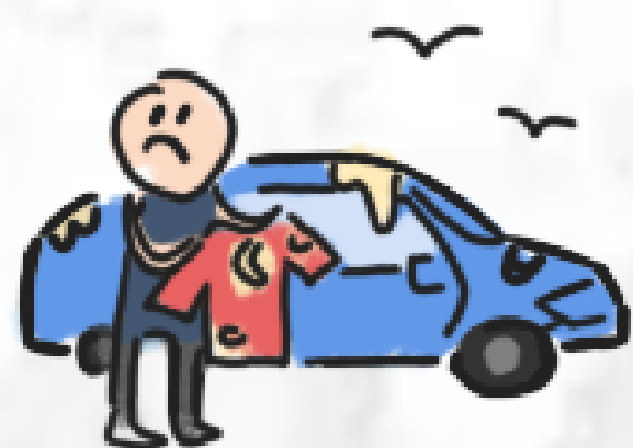
Pigeons defecating on your laundry or vehicle?