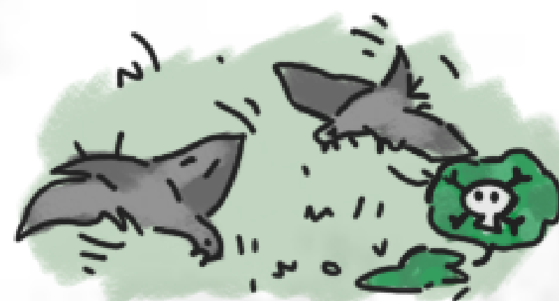
Live pigeons found struggling around void decks due to poisoning operations?