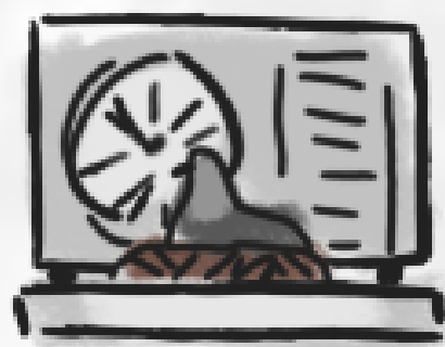
Pigeons nesting on your aircon ledges?