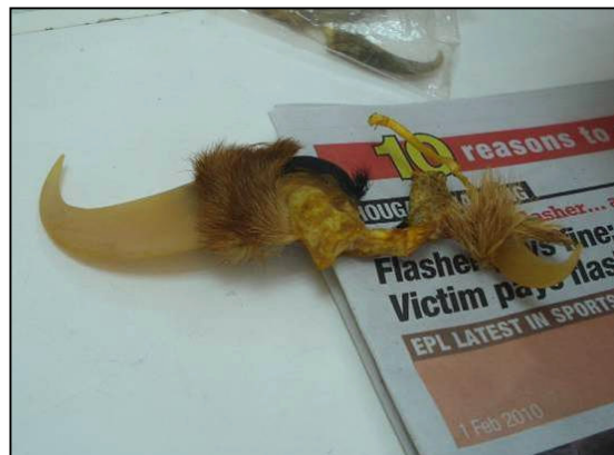
Tiger claw with skin and paw pads for sale in Little India

It is possible that some of the tiger parts on sale could be fake, either obtained from another animal or made of synthetic materials.