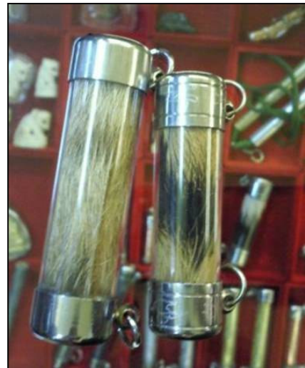
Tiger skin pieces with prayers are sold in amulets, believed to bring authority and protection.

The shopkeepers claimed that the tiger claws and teeth can be carried or worn, either raw or fixed in gold, to bring authority and protection.