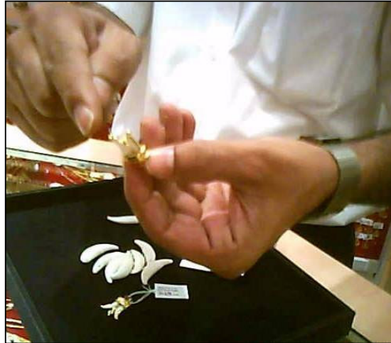
Tiger teeth offered for sale by a shopkeeper.

One shopkeeper stated that he had to stock up on tiger parts due to the demand during the Chinese New Year, because 2010 is the Year of Tiger. He said: "It is selling very fast, for these few days, a lot of people looking for such stuff....had six pieces (of tiger teeth) for the past two weeks (he had only two teeth left), just stocked up for Chinese New Year..."