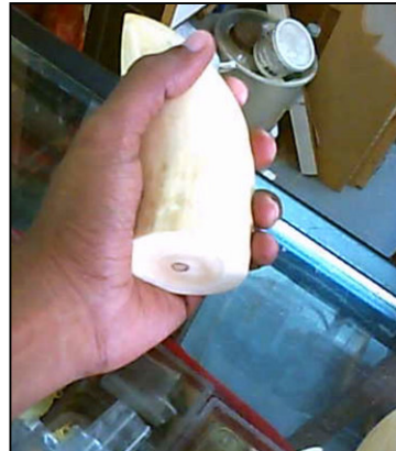
A product claimed to be whale tooth offered for sale.

The identification of these products is based on the claims of the shopkeepers.