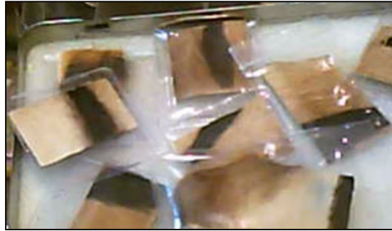
Tiger skin was offered in pieces of varying lengths.

Cut pieces of alleged tiger skin ranged from approximately four centimetres to ten centimetres in length.