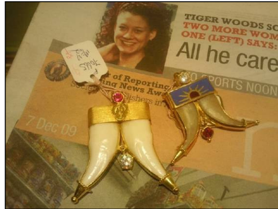
Tiger teeth (white) and tiger claws set in gold.

The claws varied in colour, some were almost black in colour, others a dark brown or cream colour. Some were slightly chipped, or had grain marks along the claw. For some of the claws, the sheath inside was still visible.